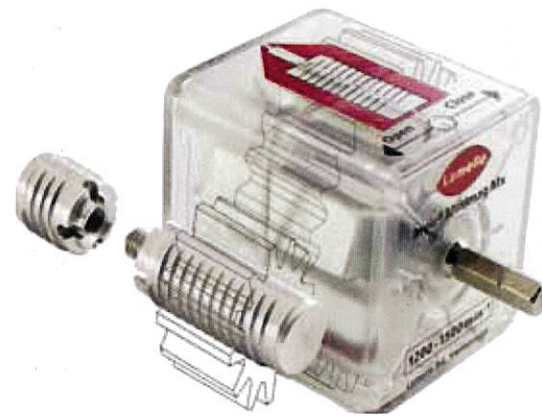
The rotating magnetic field of the Minimag Mx2 drives the joining element